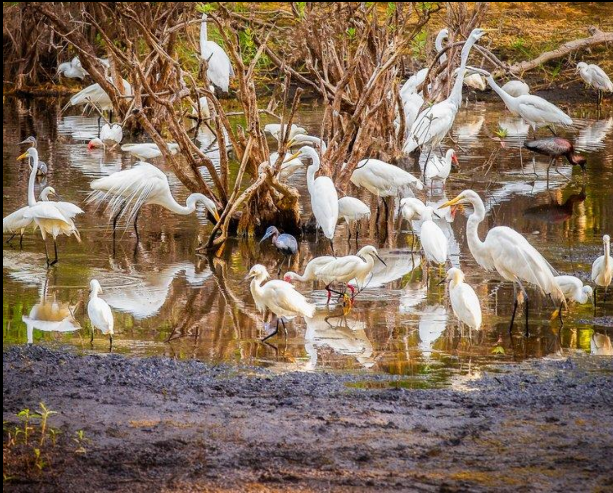
Six Mile Cypress Slough Preserve