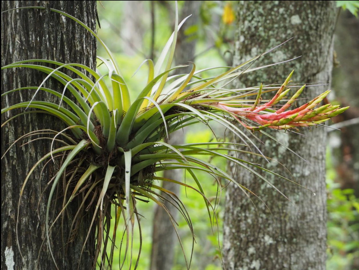
Six Mile Cypress Slough Preserve