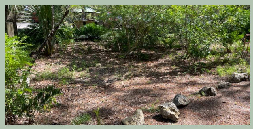
Garden before improvements

After the soil was installed thanks to our Lee County Staff, a group of Slough volunteers added salvias, mist flowers, gaillardia, coreopsis, and other native plants. Soon butterflies were observed flying about nectaring and laying eggs! Remember to take a few minutes when you visit the Slough to enjoy the butterfly garden!