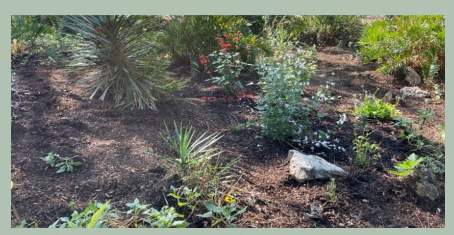
Butterflies get an upgrade with beautiful nectar plants.