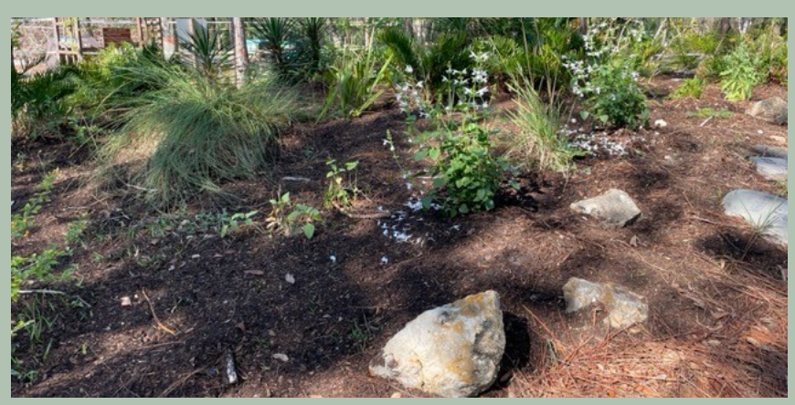
Garden after the soil remediation: Are the plants smiling?